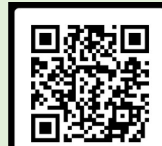
My Two Grannies