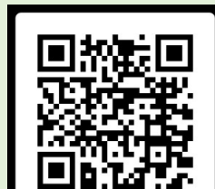
Grandad's secret giant