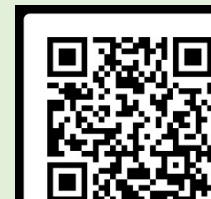
Little Beaver and the echo