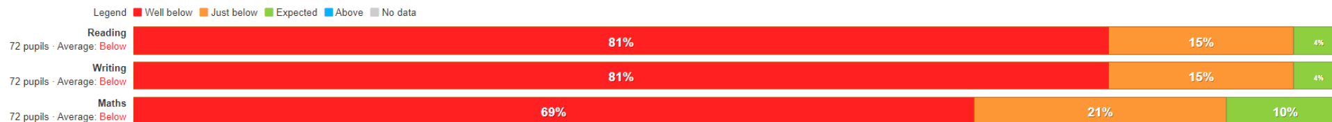
Attainment Overview for Pupils in Years 1–6, with SEN Support - 2021-2022 Spring - Main Assessment